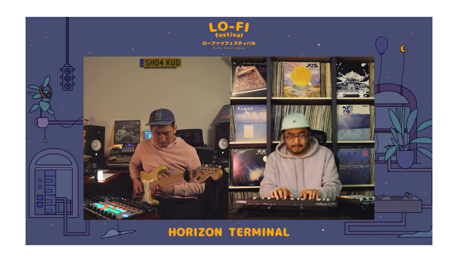
Lo-Fi Festival, 4th edition