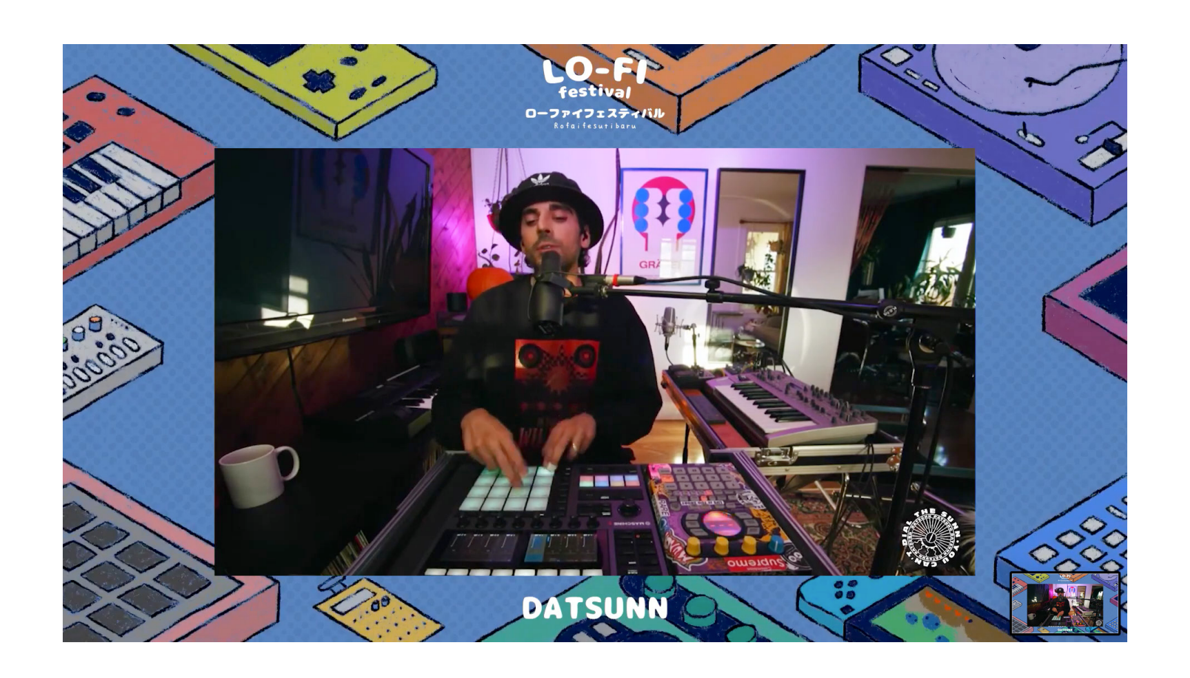
Lo-Fi Festival, 2nd edition